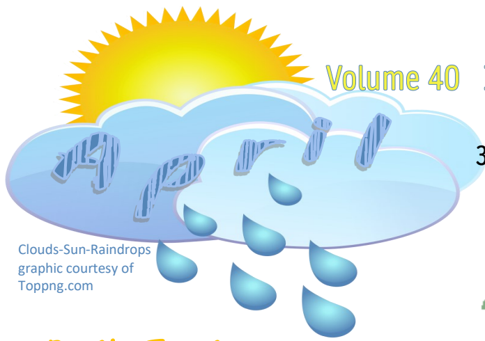
Clouds-Sun-Raindrops graphic